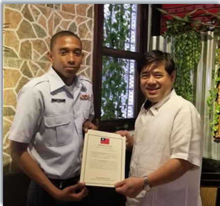
His Excellency Remus Chen, Ambassador of Taiwan to Belize.

In 2019 the Defence Section of the Ministry of National Security embarked on a Defence Engagement quest with the Ministry of National Defence of Taiwan. The Ministry of National Security sought opportunities in training and acquisition of equipment for the Defence Forces of Belize.