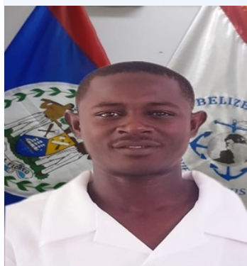
Sailor of the Month